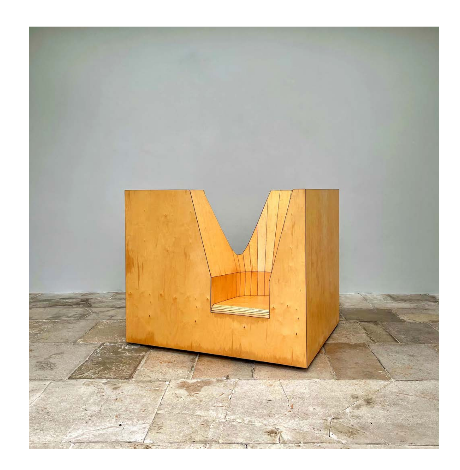
Fred Baier Love Seat 1994 (designed 1982) Lacquered birch, plywood 120 x 117 x 140 cm 47 1/4 x 46 1/8 x 55 1/8 in £20,000.00 + VAT