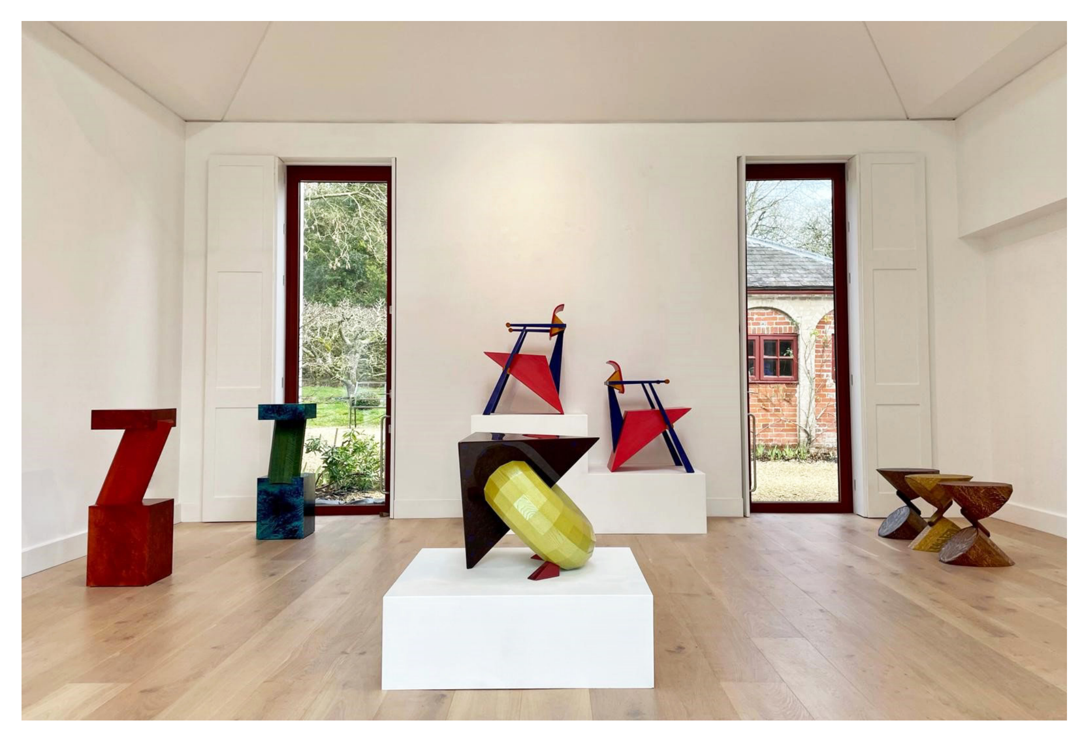
Installation view, Design House, New Art Centre.